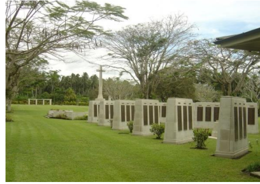
Rabaul Memorial Wall CWGC