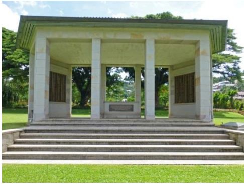
Ambon Memorial Wall CWGC