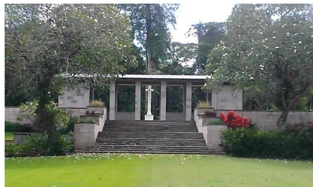
Lae Memorial Wall